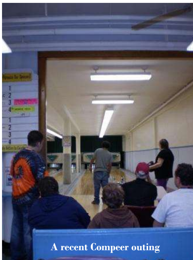
A recent Compeer outing

With the help of numerous community organizations and local universities, Compeer Rochester has launched a new program called Sports Mentoring that seeks to connect at-risk youth with recreation and fitness opportunities as well as positive adult role models. Compeer clients spend time with volunteers each month either playing or watching a sport and engaging with physical activity in the community and have opportunities to meet with professional sports teams and players. This program provides participants with invaluable experiences that foster relationship-building and promote mental, emotional, and physical well-being. If you would like more information about Sports Mentoring or to become involved with one of Compeer Rochester's other worthwhile mentoring opportunities, please visit www.compeerrochester.org , call 585-546-8280, or contact information@compeer.org .