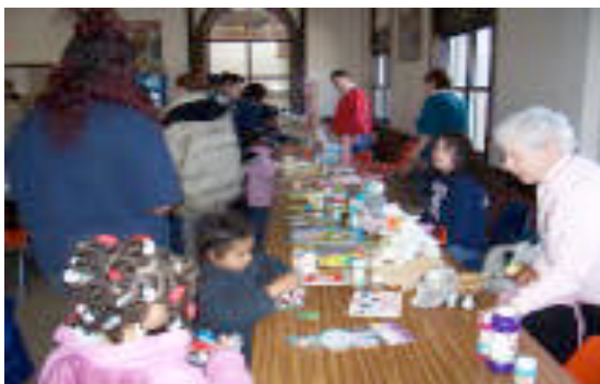
Assumption volunteers at ESWA